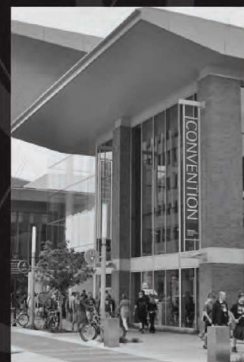
INDY CENTER – HERTZ INDIANAPOLIS, IN $22,000,000 | PURCHASE