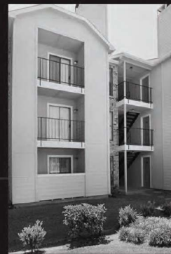
CEDARBROOK PORTFOLIO DALLAS, TX | 10 SITE $119,000,000 | REFINANCE