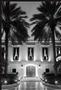
RESIDENTIAL PRIVATE HOME FT. LAUDERDALE, FL $12,000,000 | PURCHASE