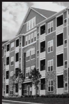
OXFORD CITY VISTA APTS PITTSBURGH, PA $36,000,000 | LOAN