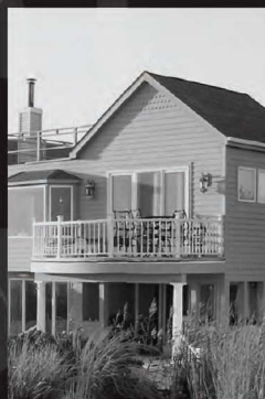
RESIDENTIAL PRIVATE HOME SOUTHAMPTON, NY $16,200,000 | PURCHASE