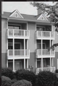
BROOKFIELD MARINA SHORES NC, SC & VA | 18 SITES $460,000,000 | PURCHASE