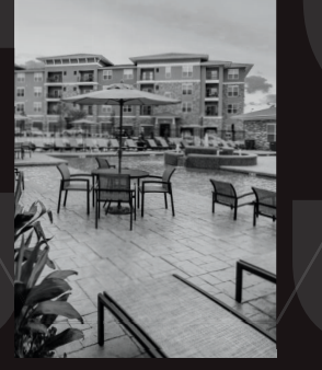
OVERLAND PARK, KS $46,479,000 | PURCHASE