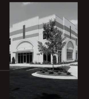
INDUSTRIAL WAREHOUSE CHARLOTTE, NC $76,200,000 | PURCHASE