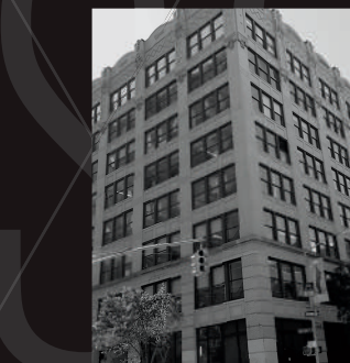
NEW YORK. NY $95,000,000 | PURCHASE